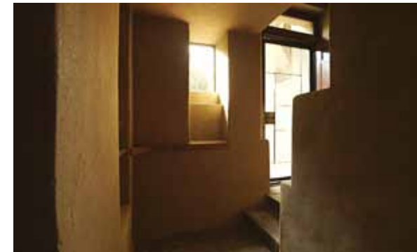
Sadhana's House Rakkar • Built in 2000