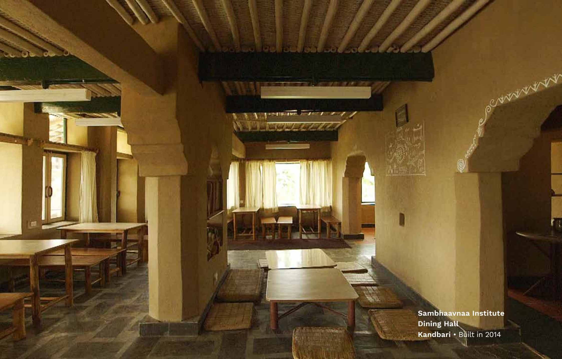
Sambhaavnaa Institute Dining Hall Kandbari • Built in 2014