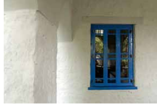
Nishta Health Clinic Rakkar • Built in 1995