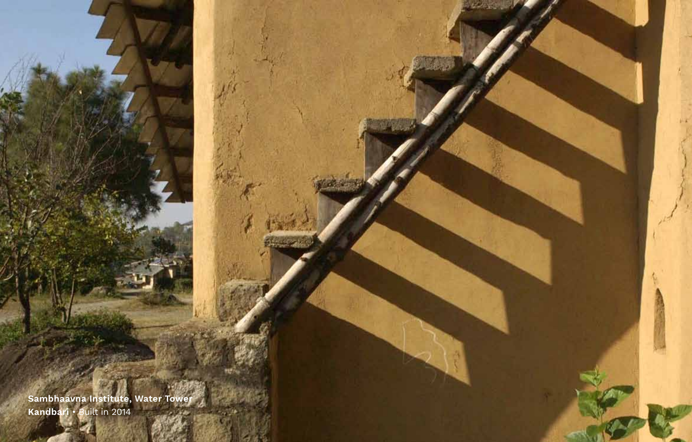
Sambhaavna Institute, Water Tower Kandbari • Built in 2014